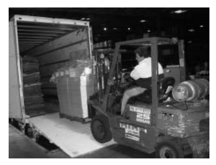
Census forms being loaded for the start of delivery on July 28.

The 2006 Census was officially launched in Canberra on 24 July to herald the start of the delivery of Census forms nationally on 28 July.